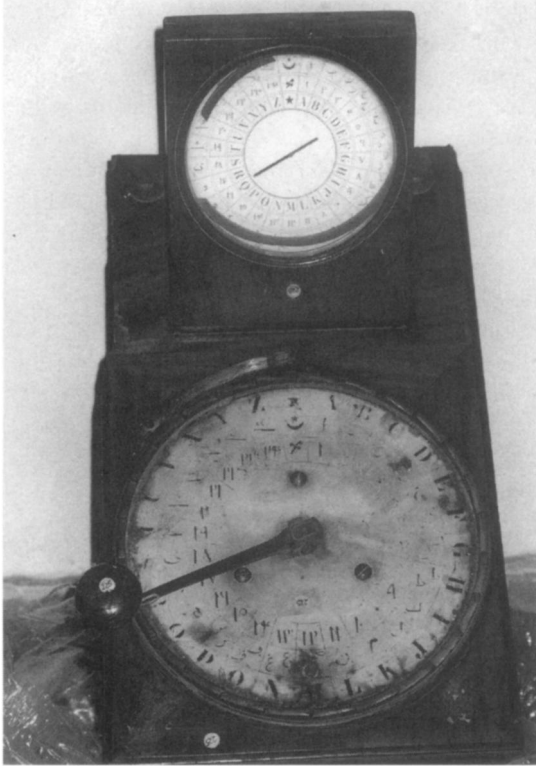
FIG. 4 Wheatstone dial telegraph apparatus adapted to Turkish language in Arabic script, with Roman letters in addition. (Postal Museum [PTT Müzesi], Ankara, No. 225.)

ments, mainly various types of Wheatstone, Siemens, and Hughes designs, were tried (fig. 4). In 1867 David Hughes himself was brought to Istanbul to develop his printing telegraph system for the Turkish language. 66 It had little success. As in other parts of the world, the Morse system superseded all others.